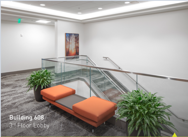
Building 608 3 rd Floor Lobby

Welcome to Columbia Tech Center. We're excited you're here.